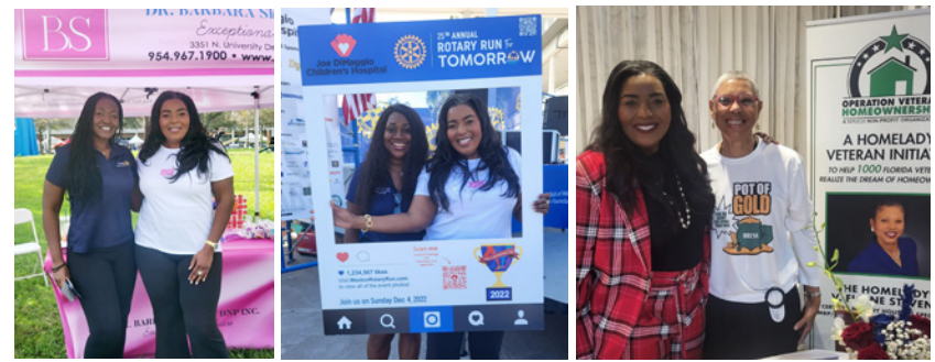
Sponsored "Veterans Appreciation Day" Event Sharing benefit information with our local veterans