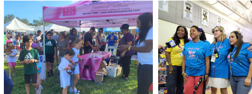
Our Toy Drive was a success. Celebrating the beginning of the holiday season at the Glades Candyland event where 300 special needs students from all over Broward County were presented with gifts.