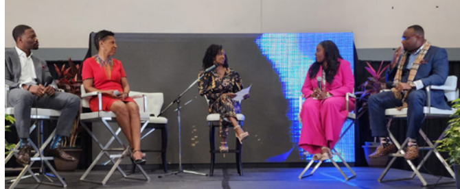
Miami Funk Fest: Financial Literacy Summit "It's A Family Affair to Generational Wealth"