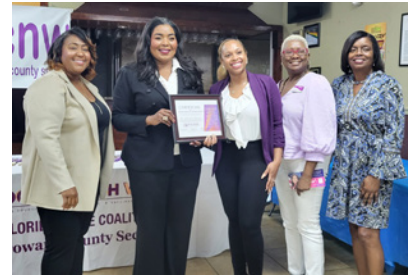
The National Council of Negro Women You Voted, Now What? Broward County Government Structure ~ Put your vote to work